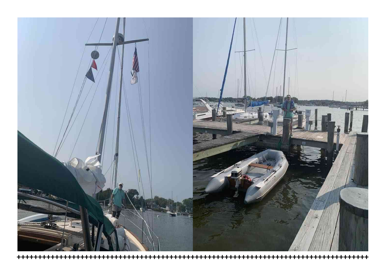
Day 13—Saturday, September 17 West River to Magothy River to Forked Creek. Our journey came to an end with our final leg, which was the return from West River, past Annapolis, under the Bay Bridge, and back to Belvedere Yacht Club.