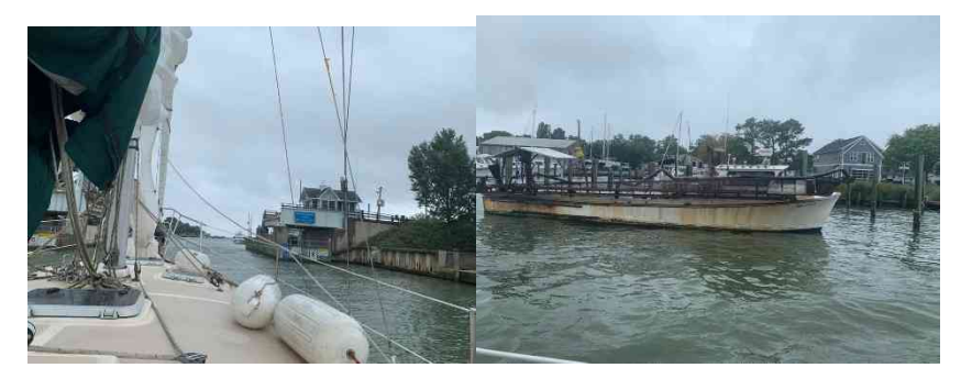
Day 8 – Monday, September 12<sup>th</sup> Dun Cove to Solomons Island Yacht Club / Patuxent River

Left Dun Cove and motored back through Knapp Narrows (2<sup>nd</sup> time), again with 1.8 beneath our 4' keel at red marker on a post closest to inlet on bay side; across the Bay and south to Solomon's Island. We found Solomon's Island to be the friendliest town! And on the way there, we were passed by the Maryland Dove (the newly completed replica of a historic ship), which as it turned out, tied up 2 slips down from us, at Solomon's Island Yacht club. The Dove headed on to St Marys early the next morning.