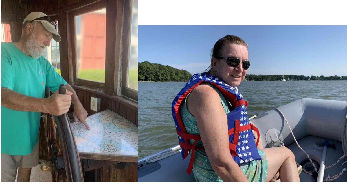
Day 12 – Friday, September 16<sup>th</sup> San Domingo Creek to Galesville/West River

Friday was the last night on our journey and 2nd to last leg; we left San Domingo Creek behind St Michaels. Motored all day, and passed once again through Knapp Narrows (with 0.8 under our keel, low tide); and with nothing much to speak of in terms of wind, a very calm day. Our beautiful daughters met us at Pirates Cove Restaurant in Galesville. (Had