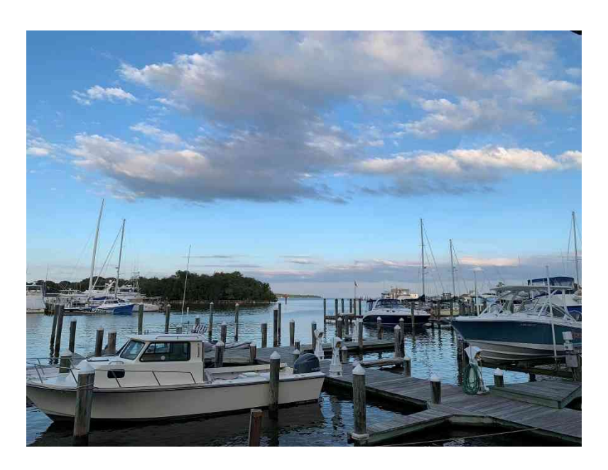
Day 10 – Wednesday, September 14<sup>th</sup> Solomons Island to San Domingo Creek/Choptank River

We covered a distance of about 30 miles. This night the last of our fresh produce was used for 'Use-Up Perishable Vegie Chili' (with our new manual pressure cooker) and cranberry drink for dinner. Meant to play Cribbage, but we were so tired from this long leg of our journey (2 hours of sailing, then 2 hours of motor-sailing, and then 4 hours of motoring), that we fell asleep early. (the wind was not terribly cooperative again). While at anchor listened to flocks of noisy geese go by, and the St Michaels church bells chime in distance too.