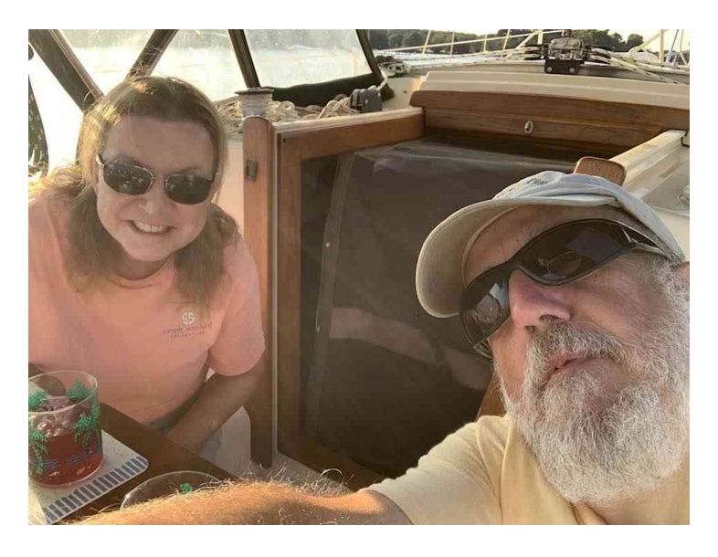
Day 11 – Thursday, September 15<sup>th</sup> Stayed at anchor in San Domingo Creek

Rest Day! Took a short dinghy ride to St Michaels, half a mile from our anchorage. Tied up at a dinghy dock at top of the creek. Walked around town for some shopping and lunch. Visited CBMM-(Chesapeake Bay Maritime Museum) and took advantage of access to their shore showers. St Michaels is a beautiful town with so many gardens. We loved playing "tourist" in town.