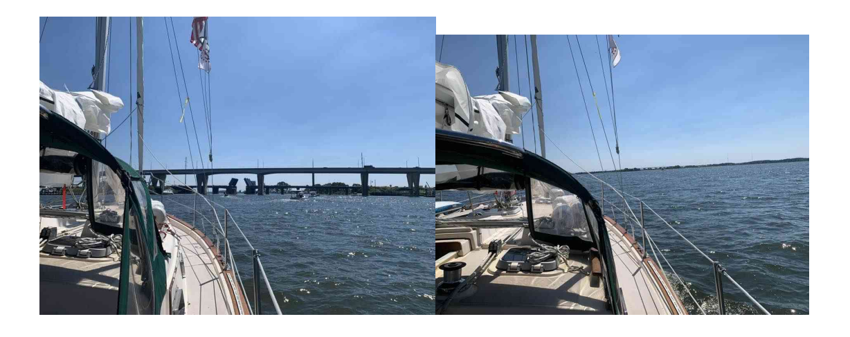
Day 6 – Saturday, September 10<sup>th</sup> Stayed at anchor at Shaw Bay

Our MRSA flotilla leaders boat was anchored just downwind form the performance and we dinghied to their boat from our anchorage where the MRSA group joined for happy hour and to listen o thev Eastport Oyster Boys, and The Wye River Band for the Shaw Bay Raftup Concert to benefit ShoreRIvers and Miles-Wye Riverkeeper